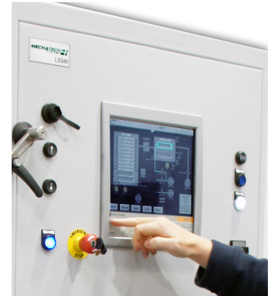
User friendly interface with 200 retrievable process profiles