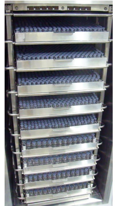
9 x 316L SS product shelves with optional stoppering

CONTACT US FOR A QUOTATION AND/OR FURTHER INFORMATION: